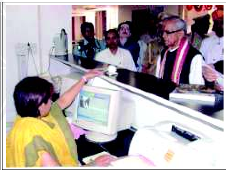
Hon'ble Governor of Gujarat Shri Kailashpati Mishra at Vadodara NSK