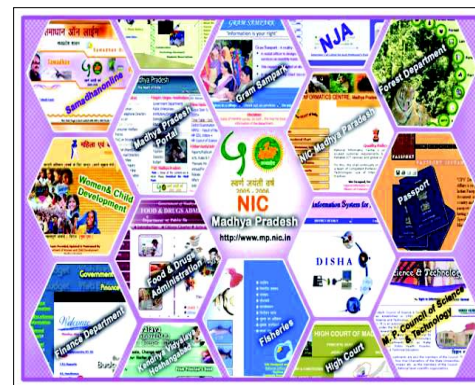
e-Governance projects implemented in the State by NIC, Madhya Pradesh