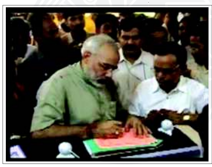
Hon'ble Chief Minister of Gujarat, Shri Narendra Modi visits the centre

Nagarik Seva Kendras have also become icons of change for the wave that is sweeping the district administration in Gujarat. People friendly staff, special arrangements for senior