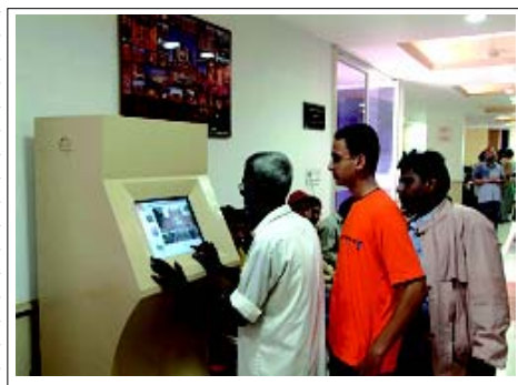
Information Kiosk at Vadodara

The ultimate goal of all e-Governance applications is the satisfaction of people. The Administration and National Informatics Centre, Gujarat through implementation of One Day Governance have managed to achieve this goal. The results have been phenomenal. People are impressed by the services being provided by these centres and are even ready to pay for them. After three years of successful implementation various sections of the community want more and more services to be added to NSK which in itself speaks volumes of the quality of services being offered.