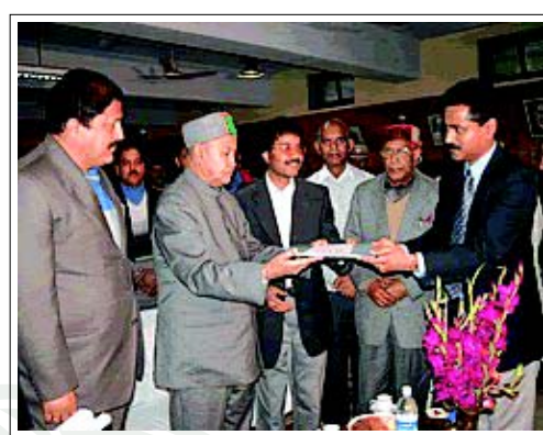
Copy of Jamabandi being handed over to the Chief Minister, Himachal Pradesh by the Deputy Commissioner, Mandi

challenging task of Land Records Computerization. NIC HP has been successful in not only designing the software to suit the intricate requirements but implementing it in all the 12 districts of HP. Presently as many as 76 tehsils have been computerized and their data is available online and efforts are on to cover 100% tehsils by the year-end. The operational tehsils are generating revenue by issuing computerized copies of land records. On similar lines, the implementation of HIMRIS (HP Property Registration) is in the pipeline. It is already under implementation at 15 tehsils and has been made fully operational in live mode. The replication in all viable tehsils will be done by the year end.