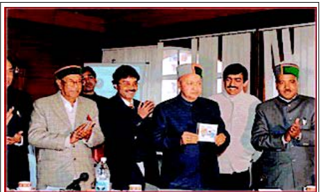
Release of REFNIC Software by Shri. Virbhadra Singh, Hon'ble Chief Minister, Himachal Pradesh

The implementation of References Monitoring System of NIC (REFNIC), that keeps track of the file/letter movement, marked the start of E-Tracking of correspondences (letters/files) in HP Secretariat. Reminders are generated automatically in printed form as well as by email and pop-up message on the screen. The application is running on approximately three hundred nodes in secretariat and emboldened with its success, the government has decided to implement REFNIC in all the districts and government departments.