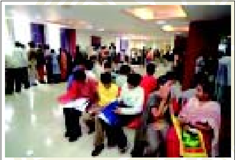
Applicants filing the application form at NSK

The once dusty, gloomy and highly bureaucratic offices have now been transformed into Centres of Excellence. These Citizen Convenience Centres, known as "Nagarik Seva Kendra", provide impeccable services at an astonishing speed.