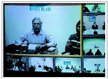
DG NIC on VC during Inauguration of Land Records Computerisation in 15 Tehsils of HP

NIC HP has achieved the set target of IT promotion in the state and recent years have seen pace in terms of expanse and magnitude along with its application and technological advancements. On the infrastructure front, NIC Himachal Pradesh can today boast of its state-of-art equipments, be it Servers Storage Equipments, Video Conferencing Network or Internet/ E-mail Service. The professional services towards Software Design & implementation need no emphasis.