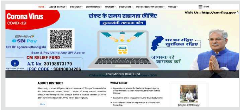
▲ Fig. 7.1: Bilaspur District Website Homepage

GIGW-compliant website that acts as an all-comprehensive source of district information on tourism, citizen services, tenders and other official state notification. It also provides information on history, demography, culture, and festivals of the districts.