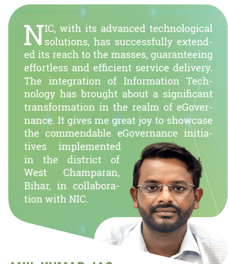
ANIL KUMAR, IAS Deputy Development Commissioner West Champaran, Bihar

The District Centre plays a crucial role in providing technical support for establishing Internet and VC facilities in remote regions of the district. This support is especially vital during visits by government officials and esteemed state dignitaries. By ensuring seamless connectivity, the District Centre ensures effective communication and collaboration in even the most remote areas. This support enables efficient interactions and information exchange during official visits while also bridging the digital divide and promoting inclusivity in remote communities.