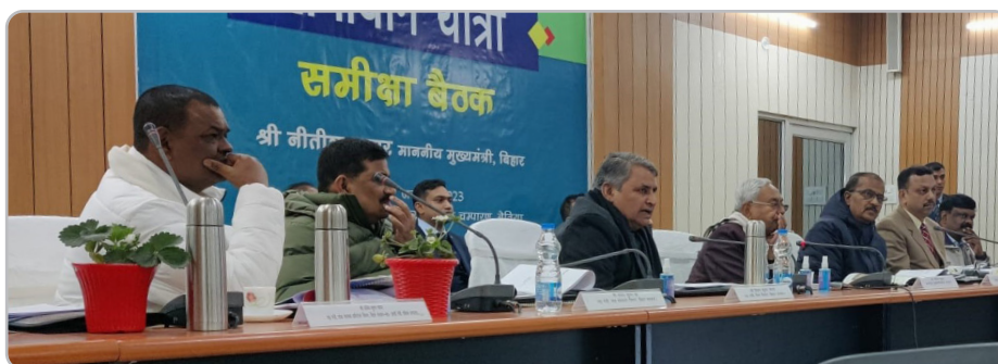
▼ Fig. 6.2 : INICNET and Videoconferencing at the forefront: NIC West Champaran facilitating seamless support during the Chief Minister's Bihar Samadhan Yatra

NIC West Champaran has shed light on the impressive technological advancements and initiatives undertaken by the district. Moving forward, they can focus on several key areas to continue their positive trajectory. This includes strengthening digital infrastructure, enhancing capacity building and training, engaging with the community, encouraging innovation and collaboration, and ensuring regular updates and maintenance. By prioritising these areas, NIC West Champaran can remain at the forefront of technological advancements, driving positive change, and delivering efficient services to the district's residents.