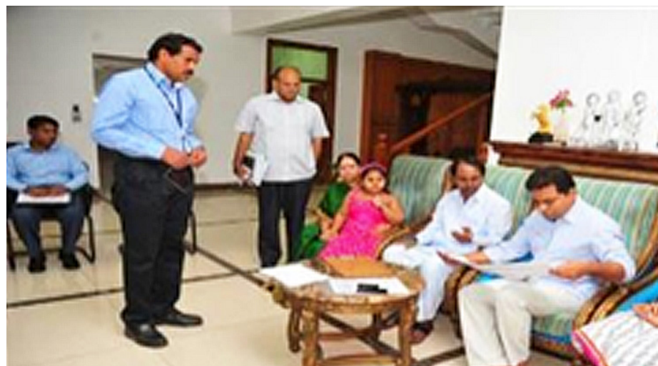
Shri K.Chandrasekhar Rao, Hon'ble CM, Telangana with his family members registering in the Samagra Kutumba Survey