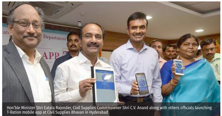
Hon'ble Minister Shri Eatala Rajender, Civil Supplies Commissioner Shri C.V. Anand along with others officials launching T-Ration mobile app at Civil Supplies Bhavan in Hyderabad

PWA application (MB-TAP) is developed to capture Geo location details and photographs of each OHSR and Household beneficiary tap connections under Mission Bhagiratha programme aimed to pro-