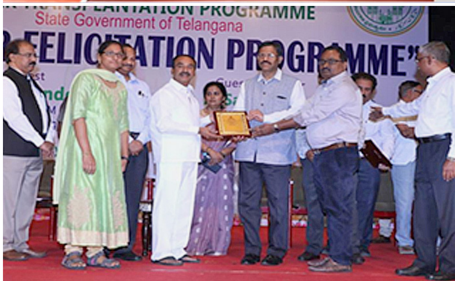
Hon'ble Minister Felicitating Shri K. Rajasekhar, DDG & SIO, NIC(TS)