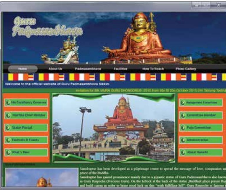
Homepage of Samdruptse website (www.samdruptse.nic.in)

Offices which are not feasible for wired LAN connectivity have been connected via long range Wi-Fi point-to-point connectivity.