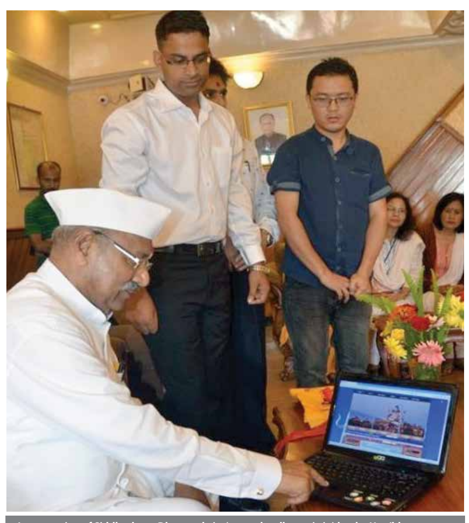
Inauguration of Siddheshwar Dham website(www.chardham.nic.in) by the Hon'ble Governor of Sikkim Shri Sriniwas Patil

A website www.chardham.nic.in has been developed for the unique pilgrimage tourism venture of the Sikkim Govern-