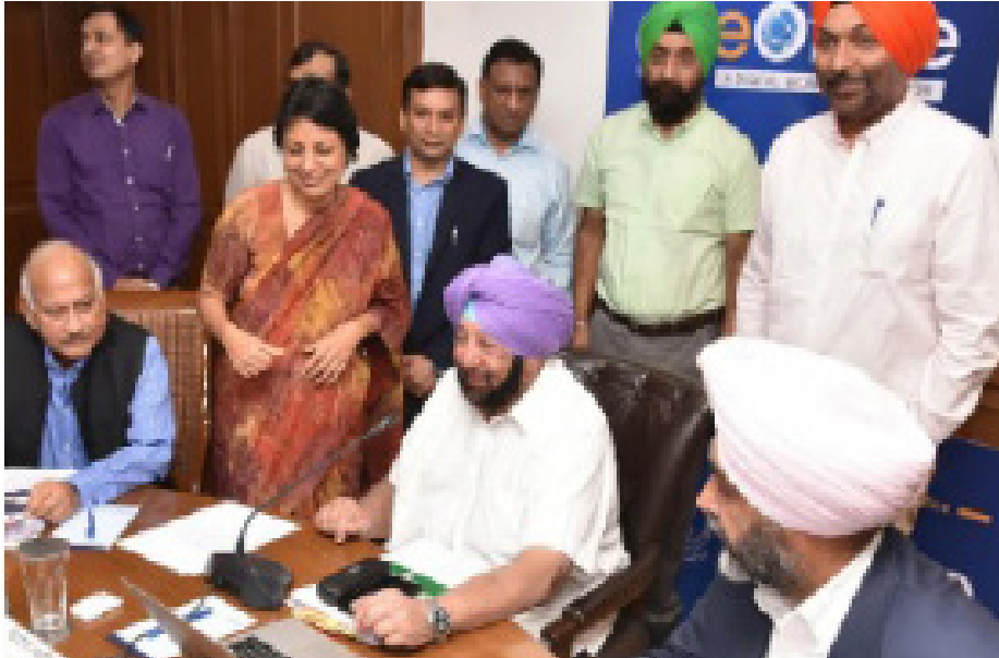
▲ Launch of eOffice by Hon'ble Chief Minister Punjab