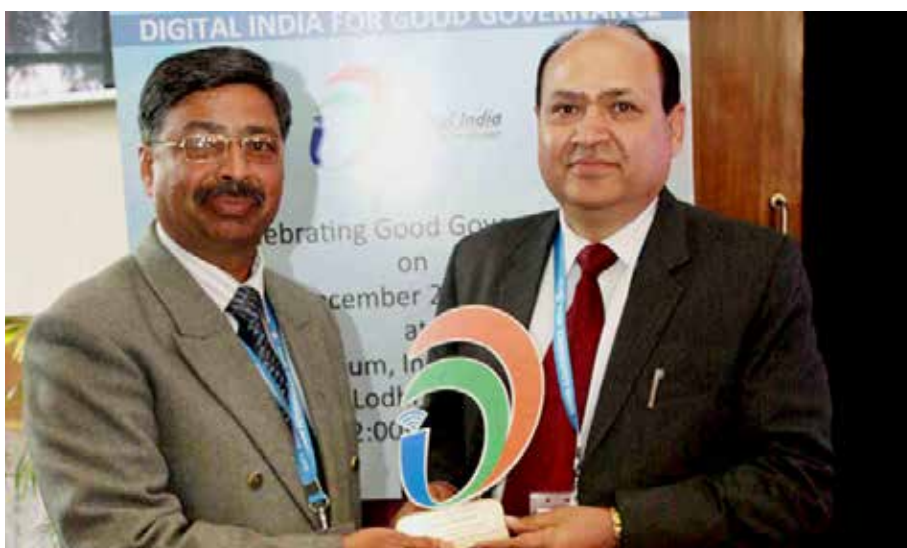
Deputy Commissioner, Sirmaur (R) and DIO, NIC with the Digital India Week, First Prize Award

The NIC District Sirmaur is fully committed to make the Digital India programme a success and to materialize the dream of our Hon'ble Prime Minister to transform India into a digitally empowered society and knowledge economy. Winning the 1st Prize in State during the Digital India Week Celebration events in July 2015 underlines NIC Sirmaur's commitment. Under this programme various types of initiatives were taken up viz., organizing webcast of Digital India Week inaugural function for all departments, opening of Digital Locker Accounts, Issuance of Digital Life Certificates to pensioners, Installation & demonstration of NIC developed Mobile Apps, organizing IT Quiz Contests and Presentation on Digital India Programmes at DC Office, District Treasury, Municipality, Schools, Panchayats to sensitize the public about various Government Citizen Online Services. Services like certificates, digital lockers have been offered during the awareness camps organised in Schools for the benefit of students.