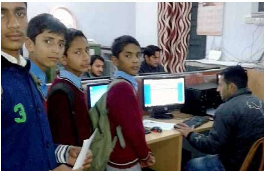
LokPraman Patra Certificates Camp organised in a school of instant issuance of certificates such as for Caste, Income, OBC and Domicile.

Permanent Driving Licenses and is implemented at all the Registration & Licensing Authorities in the district. The SW is integrated with STALL, a Screen Test Aid for Learner Licenses and enables citizens to apply online for driving licenses.