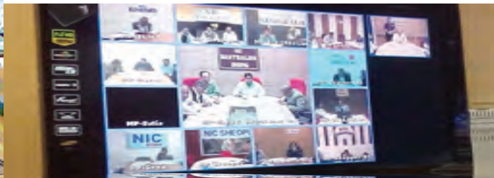
Hon'ble Agriculture Minister of MP addressing from seoni VC room after crop damage due to hailstone rain and storm

UPS and printers for efficient service delivery. OFC based LAN with NICNET has been established at Collectorate Campus connecting all sections of the Collectorate, Lok Seva Kendras, S.P. Office and office of SDM, Tehsil, Forest Department etc. Distantly located CCF office has been connected with NIC-Seoni through BSNL 2MBPS lease line.