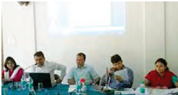
The IVFRT workshop attended by Collector, SP, Director Pench, CEOZP and all Resort/ Hotel owners at Pench National Park