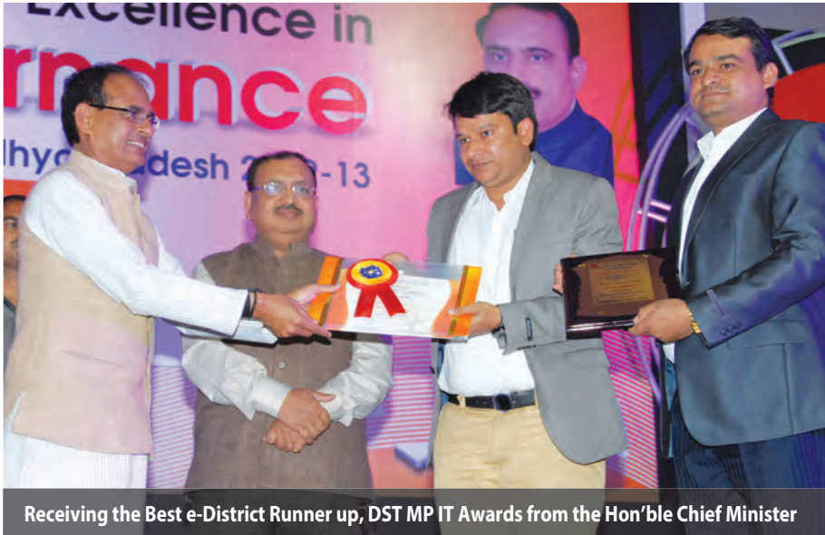
Receiving the Best e-District Runner up, DST MP IT Awards from the Hon'ble Chief Minister