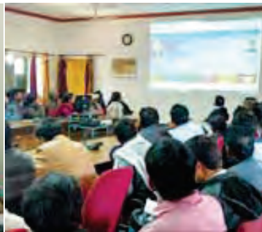
Training and awareness programmes on Digital Payments were organized at Block, School and College levels in the District