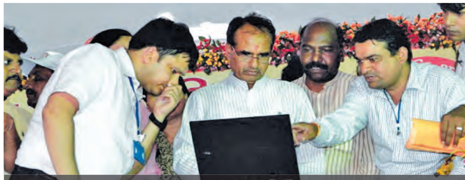
Hon'ble Chief Minister, Shri Shivraj Singh Chauhan viewing SSSM portal during inauguration

Hon'ble Chief Minister, Shri Shivraj Singh Chauhan inaugurated 'Online Sanctioning of Social Pensions Proposal' prepared by block level authorities/ users under various Government Social Security Pension Schemes through www.sssm.nic.in portal