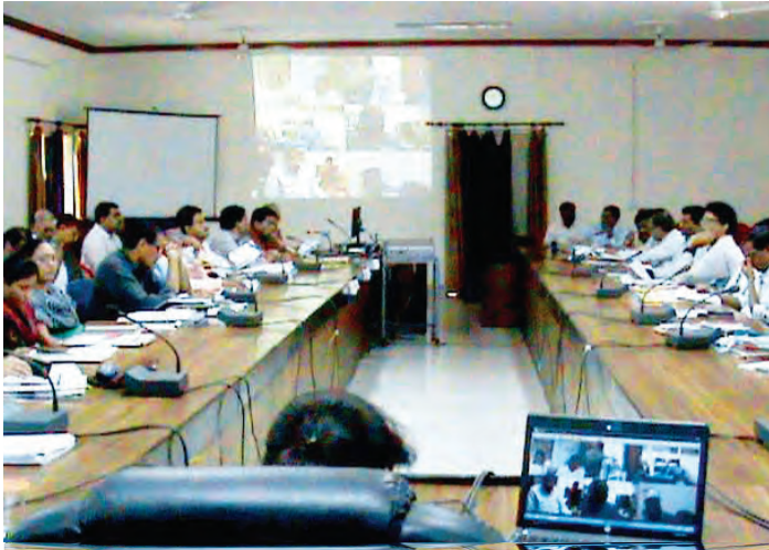
Desktop VC is being used extensively to reduce transportation of the official from block to district HQ