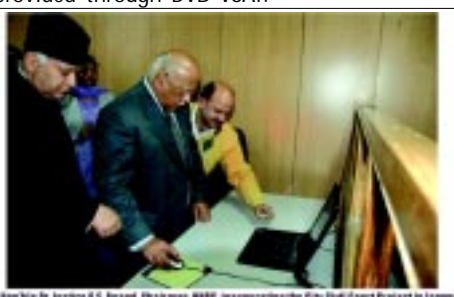
● | High Court of Jammu & Kashmir Computerization and Networking Project

has two Capitals, Jammu (winter) and Srinagar develop, deliver, install and implement (summer). There are three regions viz jammu, automated Decision Making and Decision Kashmir and Ladakh, divided into 14 districts. Support Systems in the Civil Courts of all states including J&K. In the pilot phase, City Courts NIC State Centre came into existence in October of Jammu have been covered. It will be ensured provided through DVB VSAT.