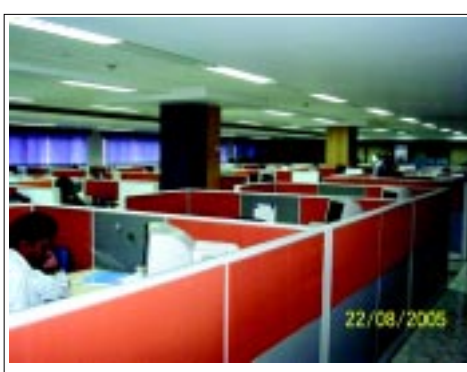
State Centre at Rajaji Bhavan, Chennai