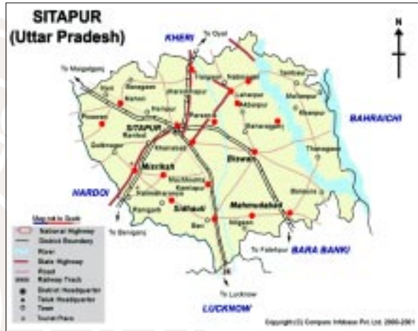
Spread of Lokvani Kiosks in Sitapur District Red dots represent the Kiosks

Lokvani has evolved as an outstanding example of a highly cost-efficient, economically selfreliant and user financed community network. This system is grounded in the rule of law, encompassing civil, political as well as economic and social rights underpinned by accountable and efficient public administration for multiphase development of rural people. The Lokvani project has successfully showcased a paradigm that can be incorporated by other administrative organizations. It has also proved that a low literacy rate and financial constraints