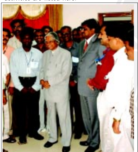
NIC Team along with District Collector, Madurai seen with Hon'ble President of India after a Video Conferencing session from Madurai to Rajasthan

NIC has been a catalytic force in ushering in reawakened government services in our country with appropriate use of ICT. NIC Tamil Nadu State Centre has been providing support to the State in maintaining the leadership position in the E -Readiness pyramid and thereby serving the citizens. NIC is involved actively in most of the Mission Mode Projects identified under National E-Gov Plan. Some of the important activities are listed here.