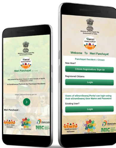
▲ Fig. 9.1: Meri Panchayat App

taken by Panchayat in alignment with SDGs, highlighting their commitment to local development