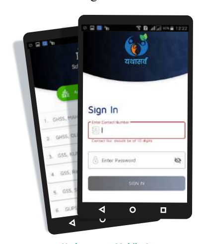
Yathasarvam Mobile App

incremental progress made from February-March 2019. A complimentary letter from CEO, NITI Aayog, was also received in this regard.