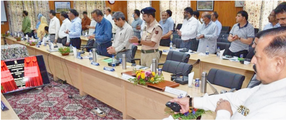
▲ Fig. 3.1: Hon'ble Union Minister of State Dr. Jitendra Singh launching Bilingual version of official website of district Budgam developed on S3WAAS platform by NIC Budgam