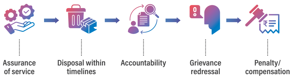
▲ Fig 3.3 Key features of MSPSDC Portal