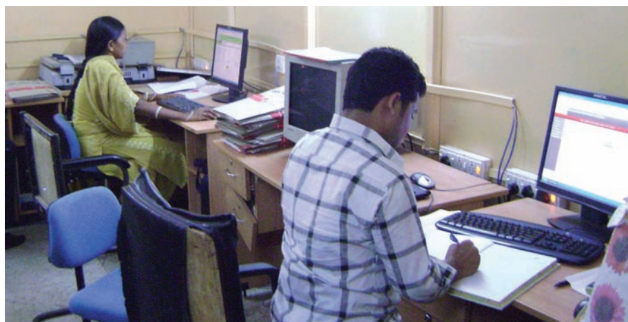
E-Swikriti -At District NIC Centre

An initiative for the payment of old age pensions at the doorstep of the pensioners in coordination with the banks has been implemented in Pakur district. The beneficiaries get their pension directly in their bank accounts. Government has made arrangements with some of the banks