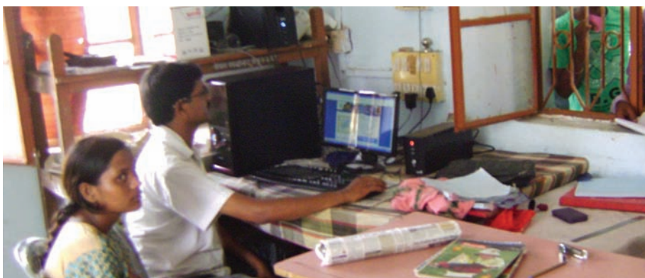
e-Nagrik Seva Kiosk at Circle Office, Pakur

milestone in bringing government services at the doorsteps of the citizens thus realizing the larger goal of e-Governance.