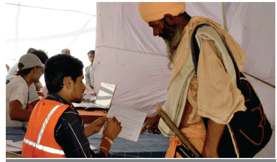
Pilgrim at the Minjar Mela receiving assistance from an NIC operative

ELECTION: Implemented the DISE (District Information System for Elections) system for entry and random