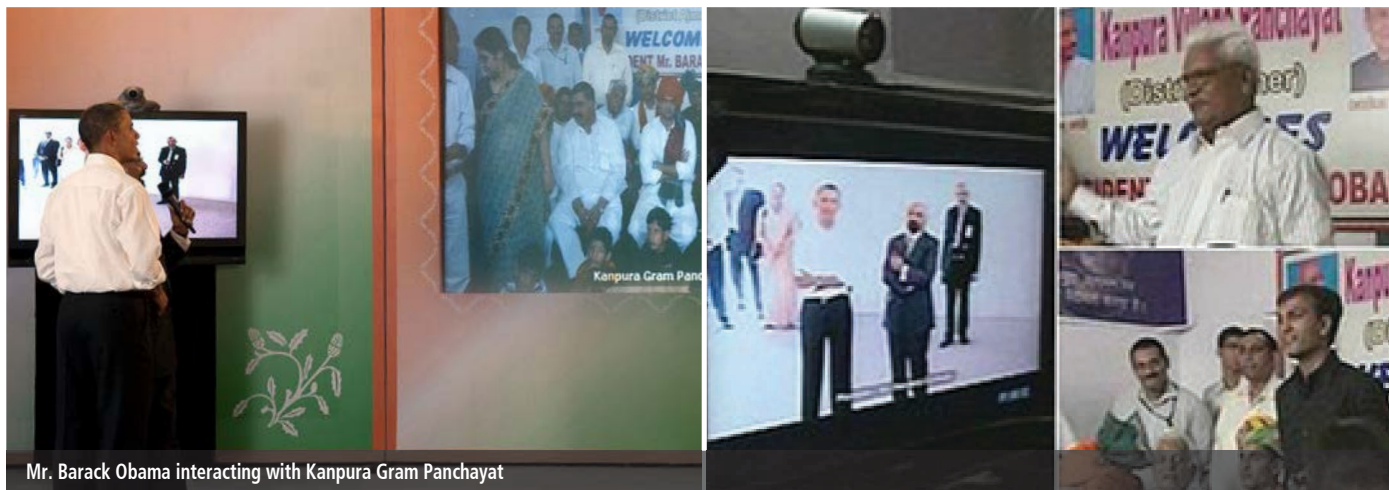
Mr. Barack Obama interacting with Kanpura Gram Panchayat

Toy Bank and Blood Bank Mobile Apps have been developed to increase the Happiness Index of the society. Toy Bank App helps collect idle toys from the society and distribute to the economically