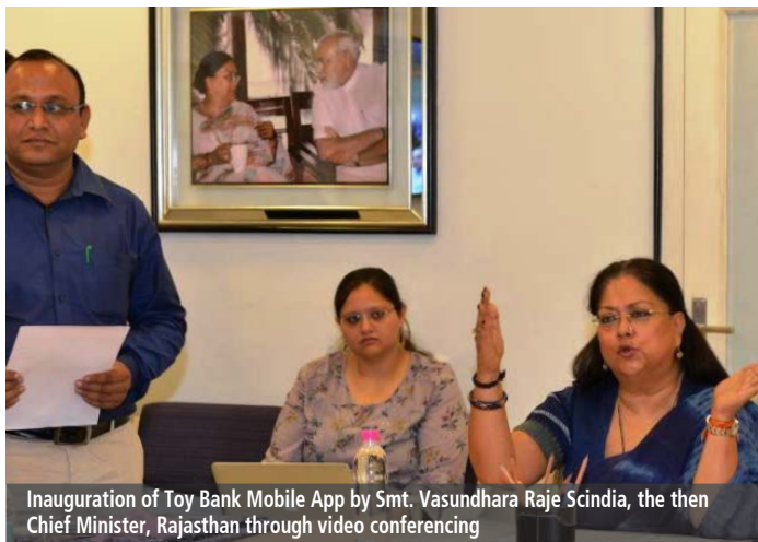
Inauguration of Toy Bank Mobile App by Smt. Vasundhara Raje Scindia, the then Chief Minister, Rajasthan through video conferencing