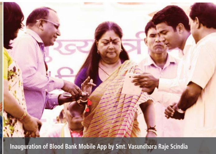
Inauguration of Blood Bank Mobile App by Smt. Vasundhara Raje Scindia

weaker society and Anganwadi. Blood Bank App is useful for patients, as it enables blood banks to send a request for the requirement of particular type of blood. The blood donor group receives this request and donates blood for patients, as and when required.