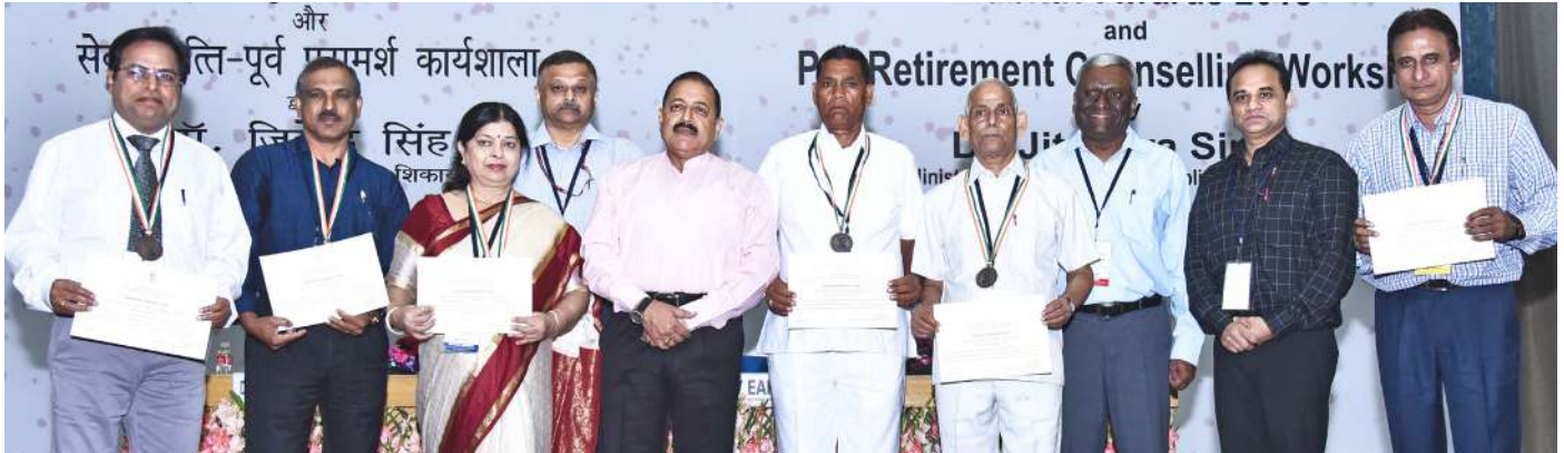
Awardees, along with other officials, seen with the Hon'ble Minister, Dr. Jitendra Singh