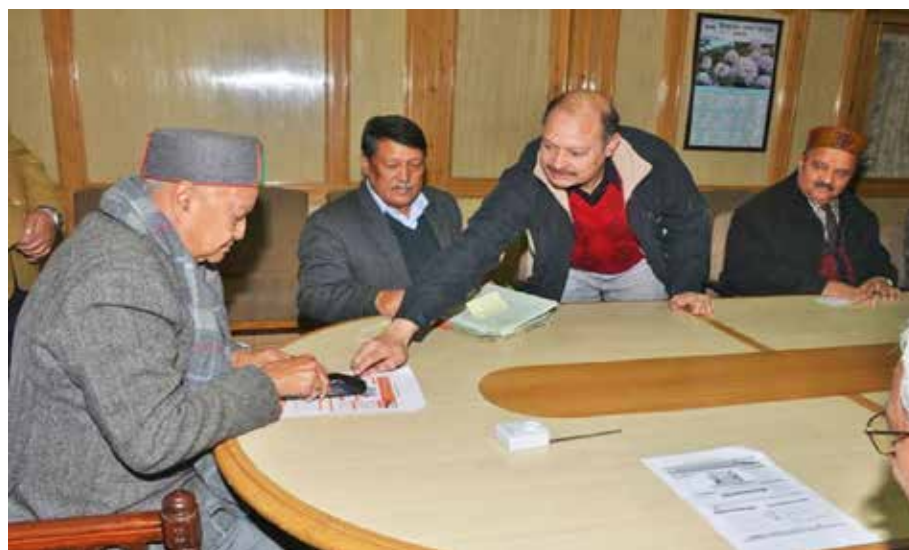
Budget Suggestions Portal - Launch by Hon'ble Chief Minister of Himachal Pradesh