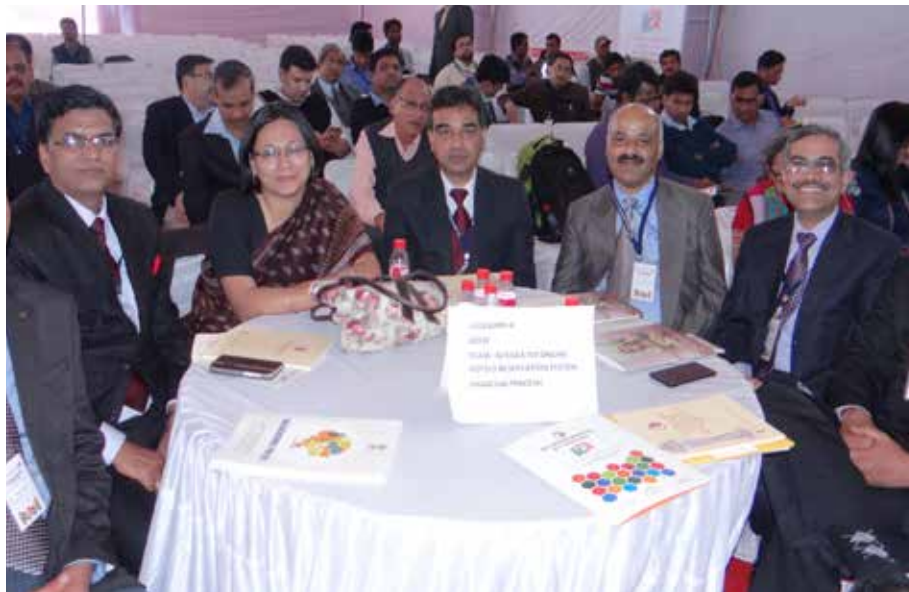
Award winners at National eGovernance Award 2015 ceremony. iOHS project received Gold

Under the Digital India program, the State was among first States to implement the Aadhaar Enabled Biometric Attendance System (AEBAS) and Jeewan Praman, digital life certificates and Central/State Government pensioners. During the Digital India week, all officers of NIC contributed in creating mass awareness among citizens and launching various online citizen services. The State was award-