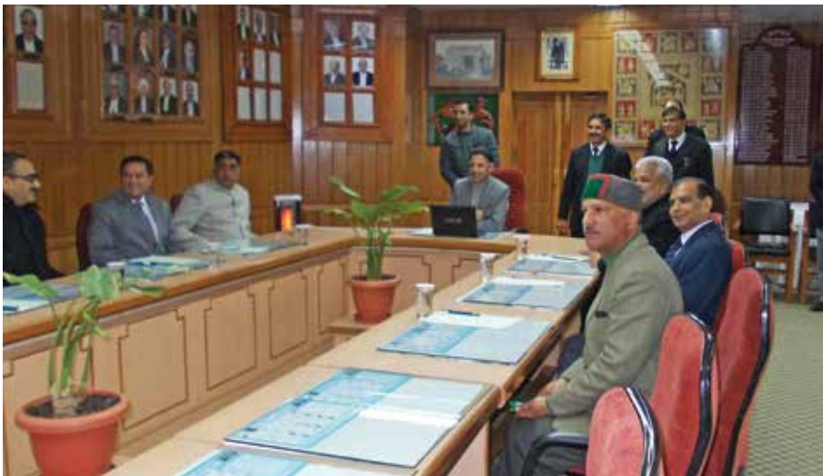
Launch of Mobile App of High Court by Hon'ble Chief Justice of HP High Court