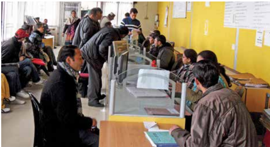
A busy day at Sugam Centre of Shimla

techno-friendly. It will establish standards for teaching-learning, assessment, school leadership and management. This will help to monitor on a continuous basis the change in learning level of students and thus making the schools self-accountable.