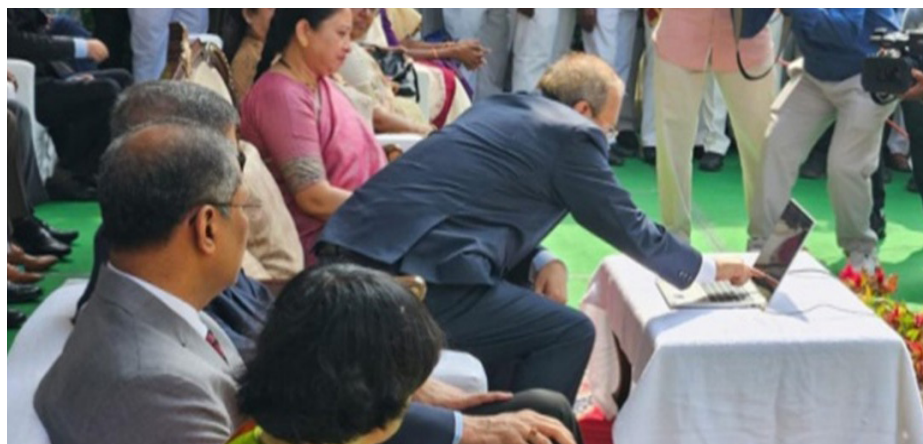
▲ Fig 9.2 : Launch of Web Portal for High Court of Telangana