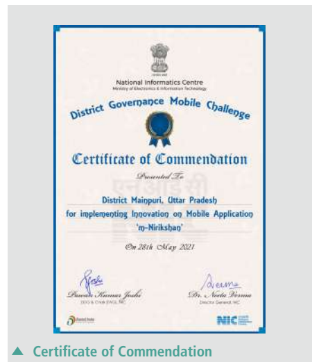
▲ Certificate of Commendation