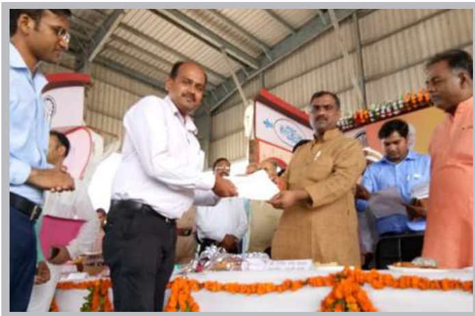
▲ Hon'ble Minister of UP, Shri Girish Yadav presenting award to DIO, NIC Mainpuri for the outstanding contributions in UP Farmers Loan Waiver Scheme

Conducted VC sessions on regular basis and various VIP's live webcast arrangements at various locations in the District. During COVID-19 lockdown period, to minimize the physical interaction among the officers, conducted VC sessions using NIC Vidyo Desktop VC solution. Necessary IT support is being provided to the District Administration in recruitment process of various posts under different departments. Computer awareness cum capacity building training programs are also undertaken regularly to facilitate effective implementation of e-Governance projects/applications.