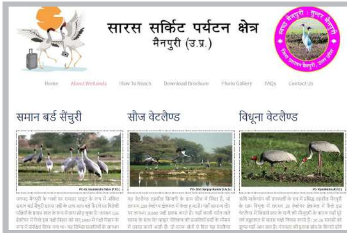
▲ Sarus Circuit Tourism, District Mainpuri website

along with demarcation of Sarus Circuit wetlands' locations on Google Map. The website is also listed under important websites column on UP Tourism web portal.