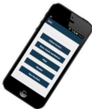
User Interface of Mobile App

The important user groups of the App are the citizens of Rourkela, Rourkela Municipal Corporation and the tourist visitors. The App is Android based and can be accessed any time, anywhere.