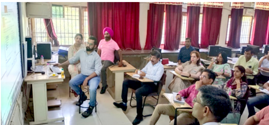
▼ Fig 1.6 : Training & demonstration session by NIC Haryana officers on installation, configuration and conduct of OCET

Haryana's Online Admissions and eCounselling system simplifies the entire admission process, right from application submission to the seat allocation, for higher education institutions. The platform handles over 50,000 admissions annually, integrating with DigiLocker and PPP for document verification, benefiting both students and 500+ institutions.