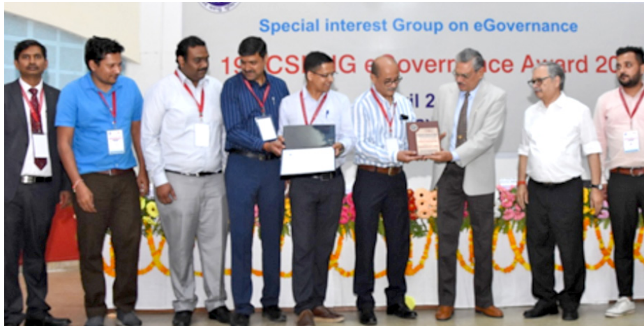
▲ Fig 1.7 : NIC Haryana team receiving 19th CSI SIG e-Governance Award under State Government Project Category for Haryana Real Estate Regulatory Authority (HRERA)

NIC Haryana has established a robust and scalable ICT infrastructure that supports the state government's digital governance initiatives. This infrastructure enables seamless communication, data management, and service delivery, ensuring that the government operates efficiently while providing essential services to citizens. The ICT infrastructure encompasses various components, including LAN networks, cloud platforms, high-speed internet connectivity, secure email systems, and advanced video conferencing solutions.