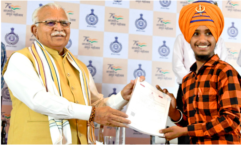
▲ Fig 1.1: Shri Manohar Lal, the then Chief Minister of Haryana, distributed Certificates under Various Government Schemes integrated with Parivar Pehchan Patra on 7th April 2022

launched new services in 6-8 hours, ensuring uninterrupted access. To date, it has received 8.84 crore applications, processing 97.9% successfully.