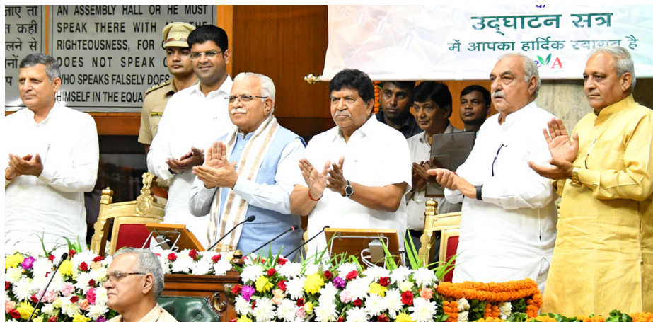
▲ Fig 1.3 : Shri Manohar Lal, the then Hon'ble Chief Minister of Haryana, inaugurating National e-Vidhan Application (NeVA) for Haryana Legislative Assembly on 8th August 2022

e-Office is a fully digital platform for managing file movements and official communications