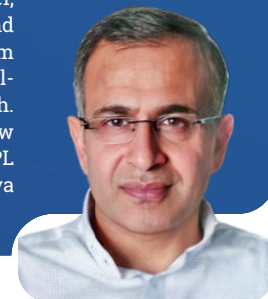
Vijayendra Kumar, IAS

The dynamic and authentic PPP database comprising 73 lakh verified families ensures that citizens can easily access benefits such as old-age pensions, caste and income certificates, and other welfare programs without repeatedly providing documentation. The paradigm of service delivery has now shifted towards “proactive service” delivery where the applicant doesn’t need to fill up a form or apply for a service, rather, it is the Government that reaches out to the citizen who is found to be eligible for any state welfare scheme. Consent is taken from citizen for the welfare scheme and if citizen is interested in availing the scheme, benefit of the scheme accrues from next month. A few examples of proactive services are Old Age Pension, Widow Pension, Divyang Pension, Widower and Unmarried Pension, BPL Ration Card, Ayushman Bharat Medical Insurance and Mukhya Mantri Vivah Shagun Yojna.