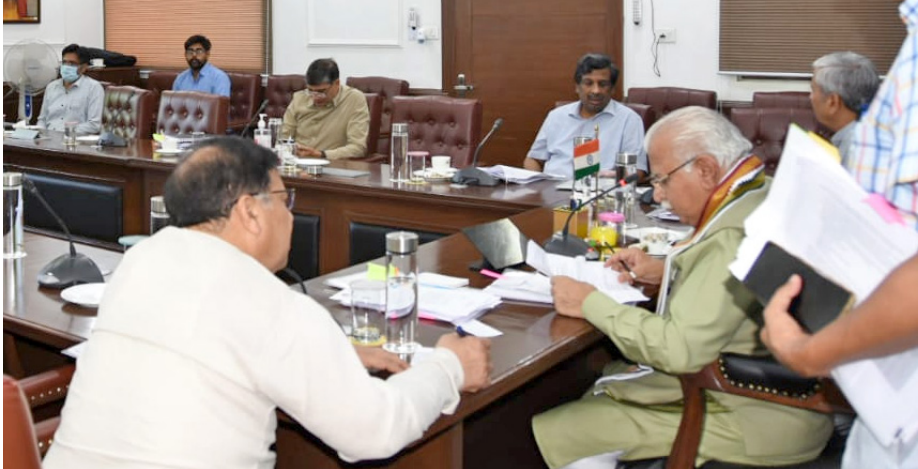
▲ Fig 1.5 : Shri Manohar Lal, the then Hon'ble Chief Minister of Haryana, launching VMTS Mobile App to enhance transparency and monitor vehicle logistics across the state

access to 33 lakh cases and 67 lakh orders and has issued over 11 lakh notices online. It facilitated 7 lakh bail orders and offers a completely digitized experience for court proceedings, reducing the reliance on physical paperwork.