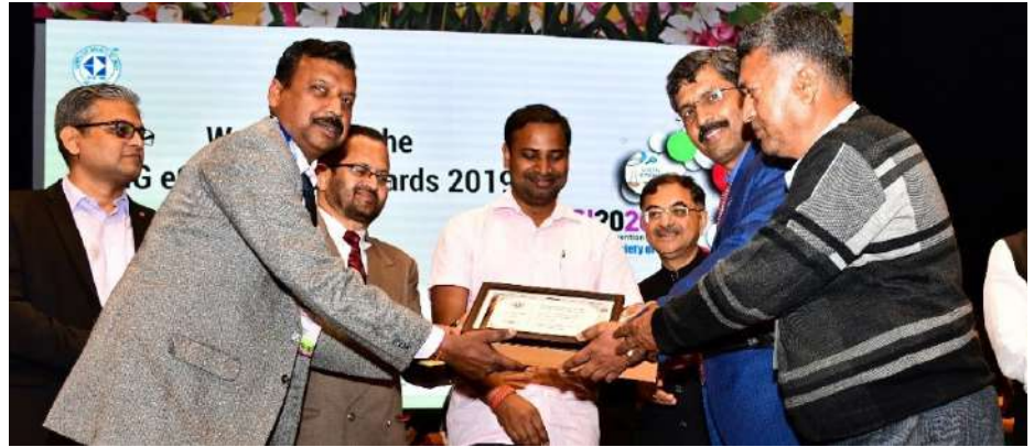
▲ CSI SIG eGovernance Award to Rajasthan Business Register, received by SIO Rajasthan, NIC and Economics and Statistics Department team