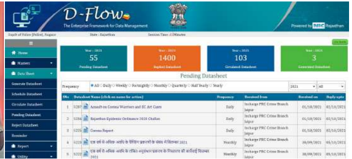
▲ D-Flow - The Enterprise Framework for Data Management

foeticide in the state. It has also helped to improve sex ratio at birth in Rajasthan. Online record of every sonography of each pregnant woman is maintained online. Presently the system covers all 3790+ registered sonography centres (government and private). Records of more than 2.5 crore sonographies is available online.