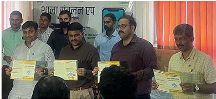
▲ Hon'ble education minister Shri Govind Singh Dotasra launching ShalaSamblan Mobile App at Jaipur.