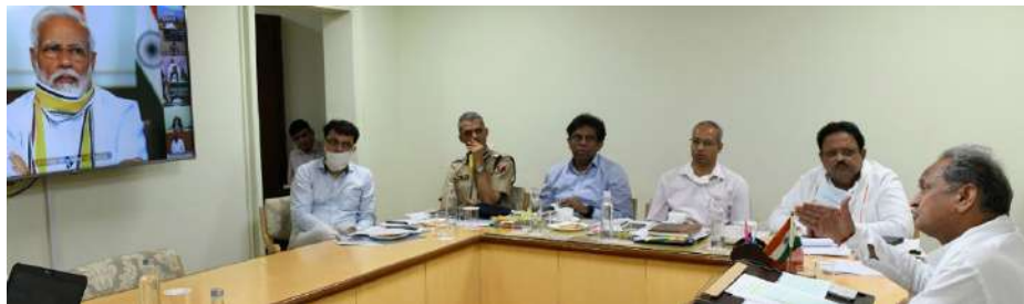
▲ Video Conferencing Session of Hon'ble Prime Minister with Hon'ble CM Shri Ashok Gehlot at CM Office, Jaipur

Rajasthan Business Register Portal is used for the online registration of business enterprises and NGOs of Rajasthan. It has been made mandatory in Rajasthan to register on portal for Organized and Unorganized sector. The registration process has no manual intervention. The system facilitates the government to keep an eye on business and NGOs activities in the state and it can be an useful tool for the government for planning.