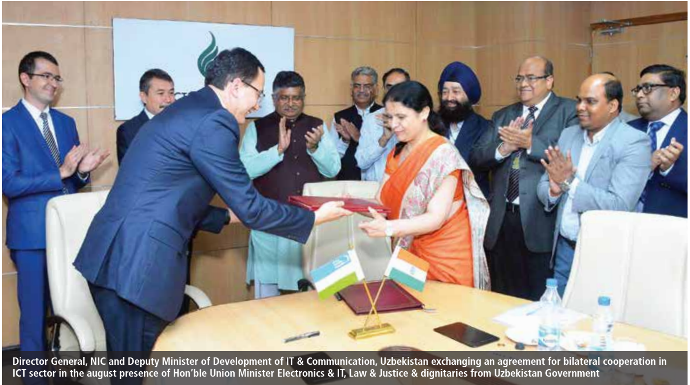
Director General, NIC and Deputy Minister of Development of IT & Communication, Uzbekistan exchanging an agreement for bilateral cooperation in ICT sector in the august presence of Hon'ble Union Minister Electronics & IT, Law & Justice & dignitaries from Uzbekistan Government

India has long been a torch bearer for promoting cooperation among countries on the areas of development such as science and technology that enables the involvement of all countries' citizens in the arrangement to lead enriched lives.