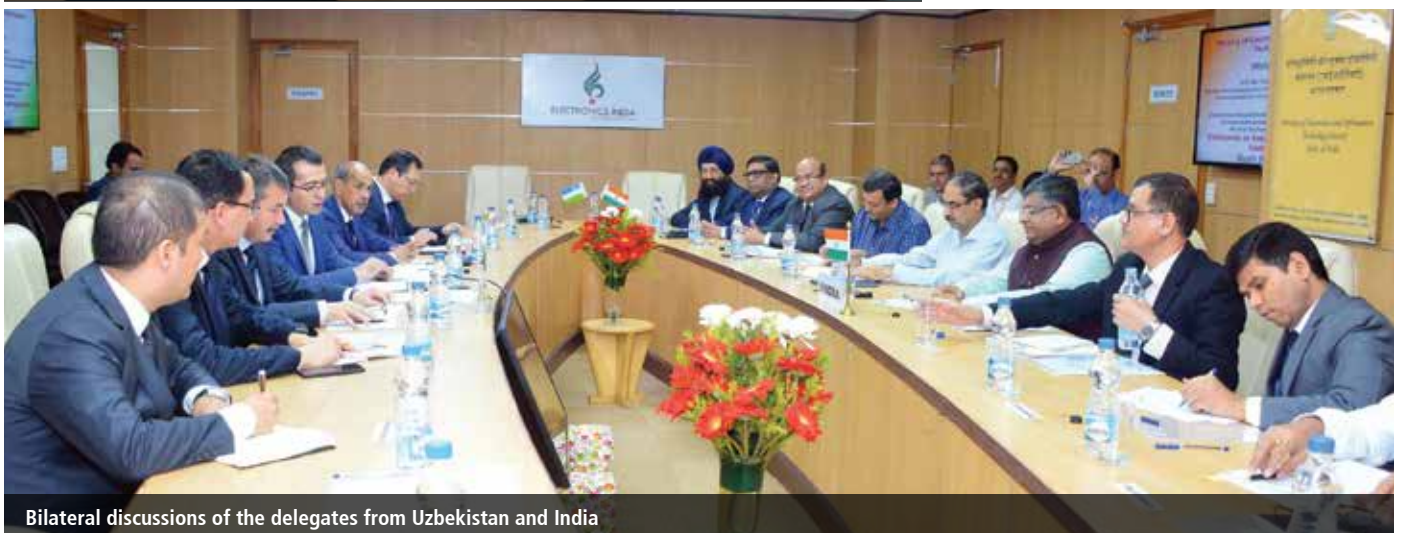
Bilateral discussions of the delegates from Uzbekistan and India

policies for an effective implementation of e-Government systems such as enterprise solution architecture, interoperability, metadata and open government data.