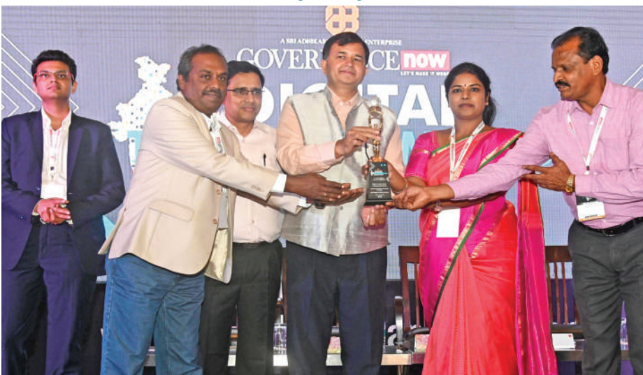
▼ District Collector, DIO, and ADIO of Tirunelveli receiving the 3rd Digital Transformation National Award

District Administration was not able to conduct weekly Public Grievances meetings due to COVID-19. But with the technical support extended by National Informatics Centre Tirunelveli, weekly GDP meeting is being conducted through Video Conference from 03-08-2020 onward. National Informatics Centre extended its support for the initiation of the web meeting, managing the virtual queue every week. This idea has attracted the attention of local media and is accepted well by all.