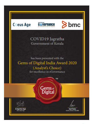
Gems Digital India Award 2020 for Covid19Jagratha

administration and NGO based on the offer. Dashboards in public and private domains are provided.