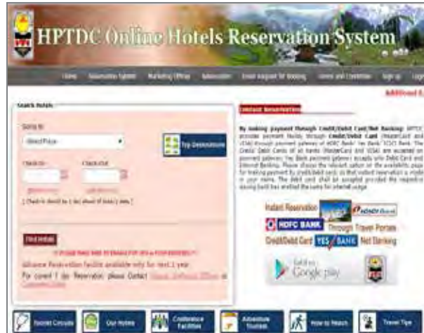
http://hptdc.nic.in/ohrs (Reservation Page)