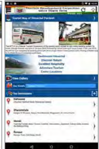
iOHRS Mobile Interface