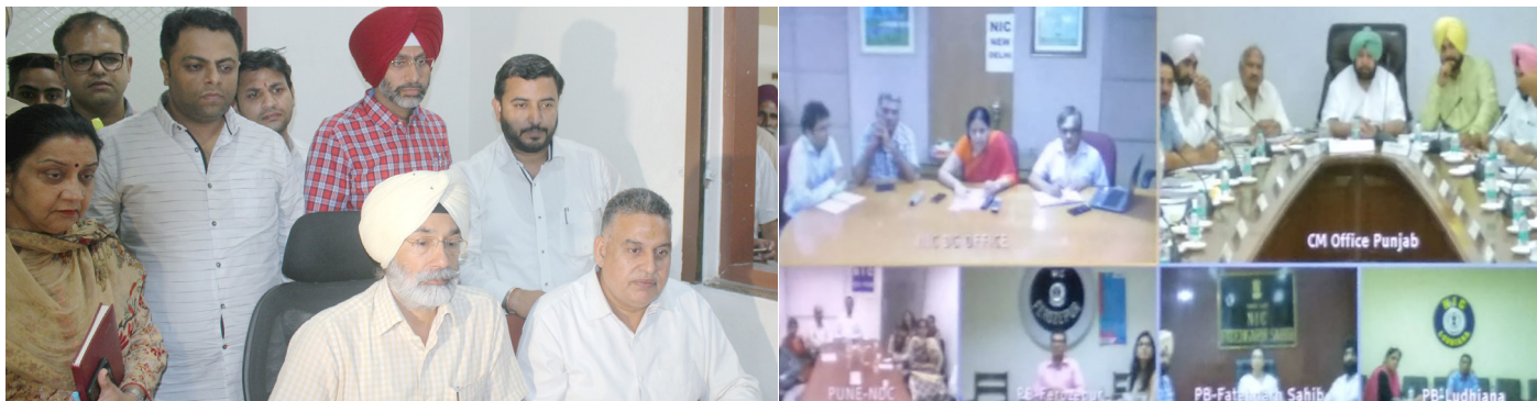
▲ Fig. 4.3: Hon'ble CM Punjab, Capt. Amarinder Singh, inaugurated NGDRS through Video Conferencing along with Cabinet Ministers and DG NIC

provides support to various application modules such as eFRRO, OCI, ICS, FSIS, Form-C, UCF Module, Deportee Module, ALIS, PAK Tracking System and Online Indian Citizenship to various departments of both Central and State Governments.