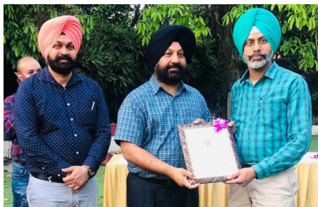
▼ Fig. 4.4: NIC Amritsar felicitated by DC Amritsar, Punjab in recognition of services provided during Punjab Vidhan Sabha Elections 2022

A dedicated web-section "Amritsar Fights Corona" was created on official Amritsar District Administration website for dissemination of authentic information to the public viz. Office orders related to Containment Zones, Restrictions, Lockdown, Testing Centre, Vaccination Centre, Hospital Bed Availability, Oxygen Supply, Home Isolation and Emergency Contact, Control Room Helpdesk, ePass, Charity, and other COVID-19 events.