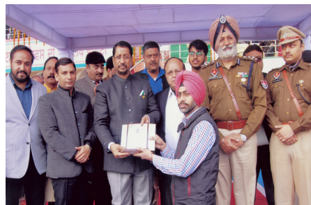
▼ Fig. 4.5: Commendation Certificate for NIC Amritsar by Shri Anil Joshi, Hon'ble Minister for Local Bodies, Government of Punjab