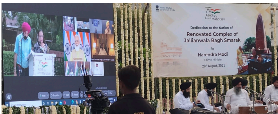
▼ Fig. 4.2: Renovated complex of Jallianwala Bagh Smarak dedicated to Nation by Hon'ble Prime Minister, Shri Narendra Modi via NIC VC Service

Being a border district of Punjab, Amritsar has two land immigration check posts, first at the International Airport and second at Foreigners Regional Registration Office (FRRO). NIC District team under the IVFRT project provides technical support to FRRO Amritsar, ICP Attari Road Amritsar, ICP Attari Rail Amritsar, ICP Airport Amritsar, ICP Dera Baba Nanak (Kartarpur Corridor) and District Foreigner Registration Office (DFRO). The team