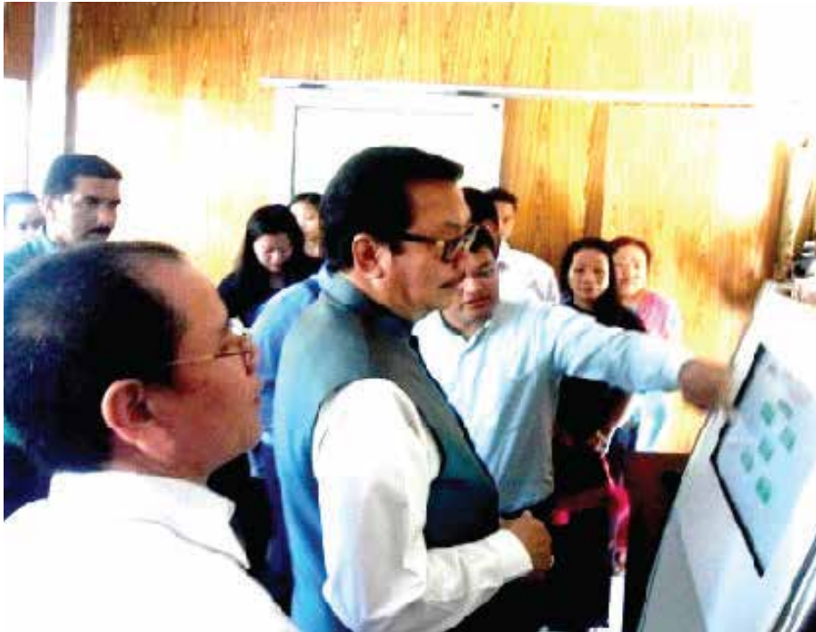
A Kiosk system – 'Lohit Information on Fingertip' was inaugurated by the Hon'ble Deputy Chief Minister, Shri Chowna Mein, in NIC Tezu, DC Office Complex, in presence of DC Lohit, Shri Danis Ashraf (IAS)