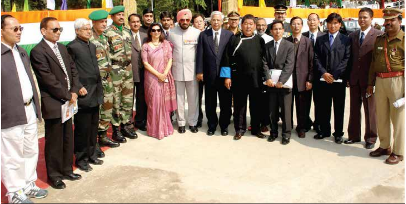
Former Governor, General (Retd.) J. J. Singh with recipients of State Award