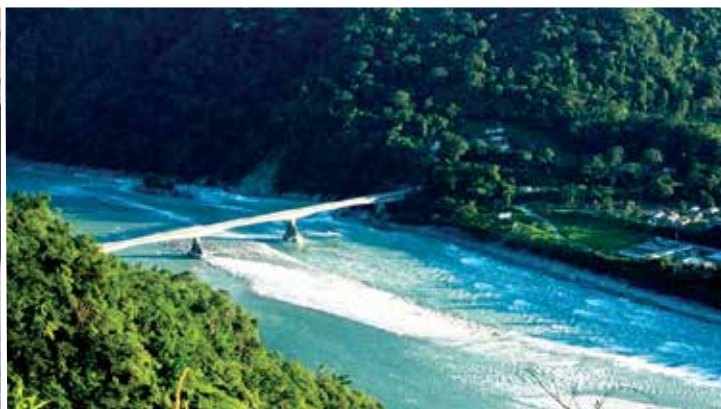
View of Parshuram Kund