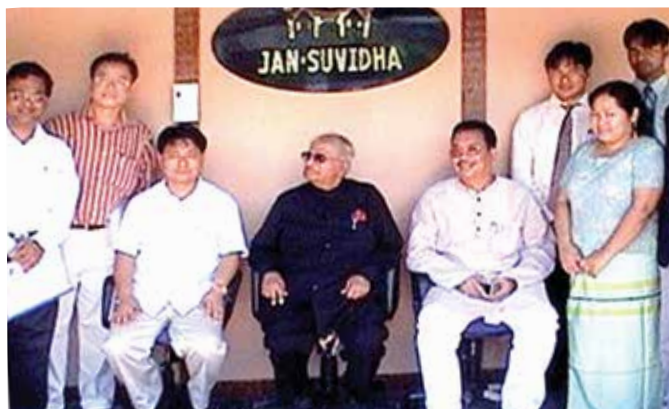
Visit of His Excellency, the Governor of State, Shri S.K. Singh (file Photo)