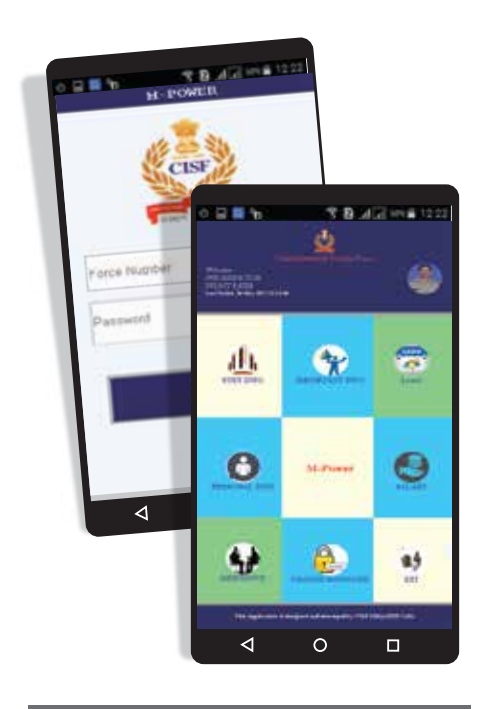
M-Power Mobile App

concept has been successfully tested using a working prototype developed by the CISF.