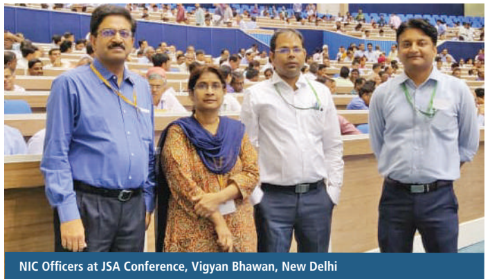
NIC Officers at JSA Conference, Vigyan Bhawan, New Delhi