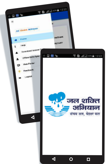
JSA Mobile App