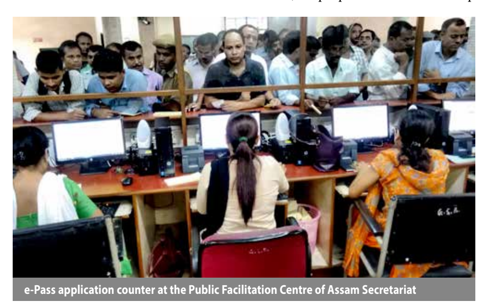
track of visitors was available. With its implementation, various reports are also provided to the Administration such as daily count of visitors, most visited departments and the district from where the highest number of citizens has visited the Secretariat. The validity of the passes is ensured by the system thus curbing counterfeit passes. Quick capturing of the barcode data using the barcode scanner also reduces the long queues at the Security gate. A citizen can apply for online pass 5 days prior to his/her visit and the pass can be collected from the security gate itself.

Prior to implementation of the Application, no proper mechanism to keep