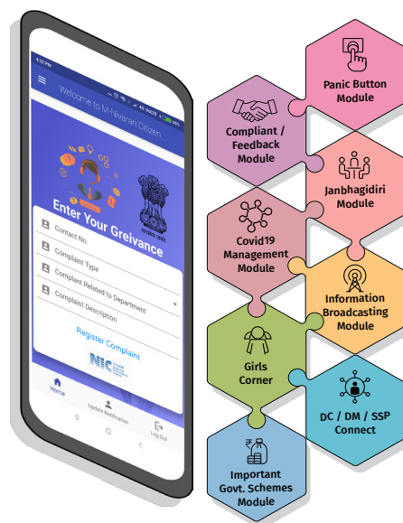
Modules of M-Nivaran App

The Mobile Based Citizen Centric Solution, M-Nivaran was designed to provide an umbrella platform starting from panic button for the females in danger and to all Government Popular Schemes, Grievances, Janbhagidari (helped administration by civic participation) to Covid Crises Management including Vaccination, Covid Dashboard, and real time update to the citizens about various restrictions imposed during partial lockdown etc.