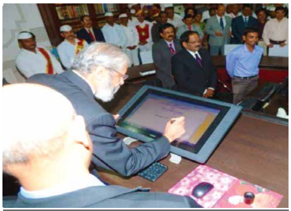
Hon'ble Judge making his remarks on the Touch Screen Monitor of eCourt

The identified case records for the particular court are scanned in advance with proper book markings of the relevant papers. Generally, the process of scanning is outsourced to private vendors for the sake of convenience. Once the scanning