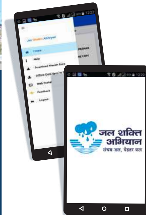
JSA Mobile App

It features geotagging options for the activities (photographs) being carried