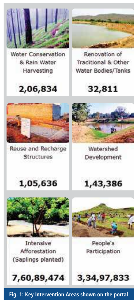
Fig. 1: Key Intervention Areas shown on the portal

A unified platform to manage all the activities related to the campaign, Jal Shakti Abhiyan portal ( https://ejalshakti.gov.in/jsa ) receives data continuously from all over the country, and the reports are refreshed and updated every 30 seconds. A scoring methodology has been devised for evaluating ranking of the districts and generating a competition among them. The ranking list is refreshed every half an hour. The portal provides status report of various param-