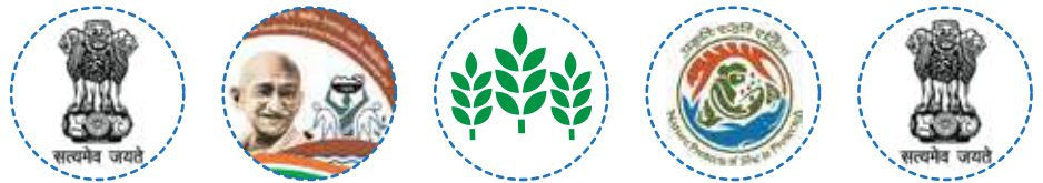
Ministry of Jal Shakti