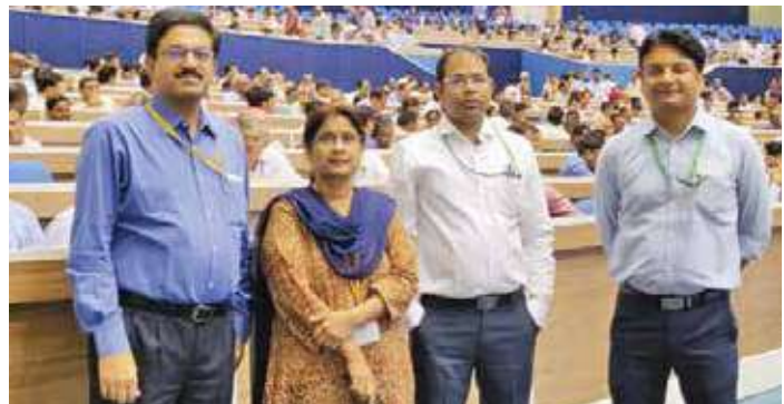
NIC Officers at JSA Conference, Vigyan Bhawan, New Delhi