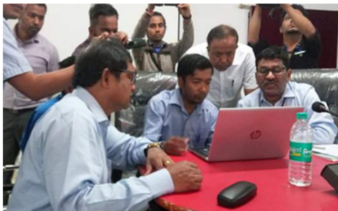
Online randomization of polling personnel under Golaghat Election District in the presence of general observer during Lok Sabha Election 2019