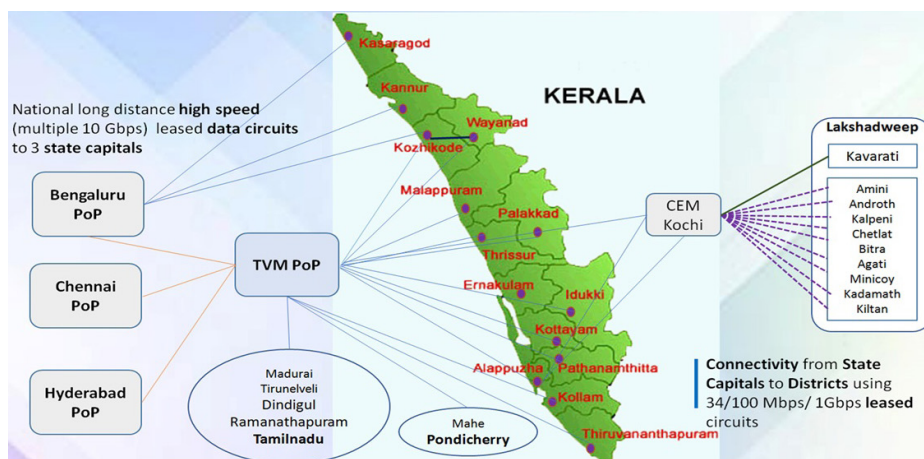
▼ Fig 3.8 : NICNET Connectivity

Athidhi is a multilingual portal developed for registration and management of migrant workers in Kerala. The platform supports mandatory registration and related administrative activities for migrant labourers in the state.