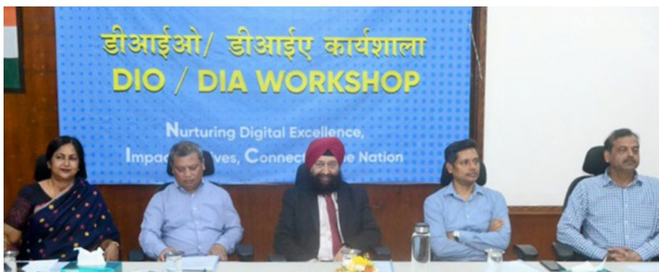
▼ Fig 3.10 : Inauguration of DIO Workshop by DG (NIC) in presence of Secretary (E & IT) & CEO Kerala, State Coordinator (Kerala), SIO (Kerala & Lakshadweep) and HoG (Personnel)

Collectively, these technology-driven initiatives provide a strong digital foundation for efficient governance, secure service delivery and sustainable digital transformation across Kerala.