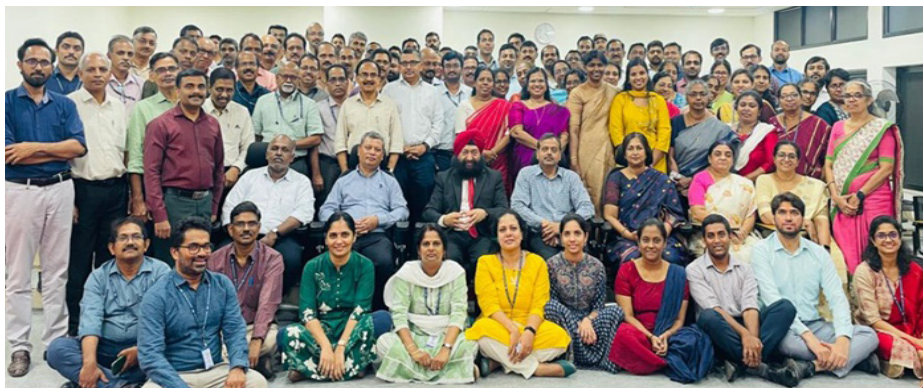
▲ Fig 3.9 : DG (NIC) with Team NIC Kerala during the visit of DG (NIC) to NIC Kerala

can be integrated with applications developed in Java, PHP and .NET.