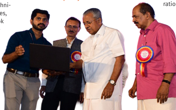
▼ Fig 3.2 : Launch-of-Direct-Selling-Business-Portal Portal developed by NIC Kerala

vides digital services related to ration card management through CSCs and citizen portals. It supports categorisation of ration cards under NFSA provisions and digitised beneficiary identification using inclusion and exclusion criteria.