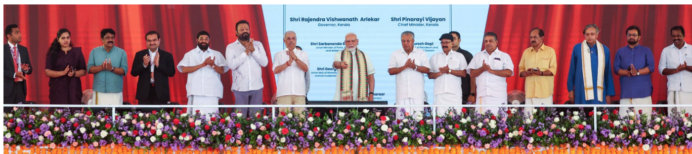
▲ Fig 3.1 : Hon'ble PM Visit to Kerala ICT support given by NIC Kerala

farmers to register, declare land and crops and apply for services offered by the Agriculture Department. Farmers can apply for crop insurance, crop loss assistance, royalty support for cultivable paddy land and other schemes. Applications are processed digitally at Krishi Bhawan, block, district and directorate levels. The system is integrated with a centralized DBT module and state treasury for direct transfer of benefits.