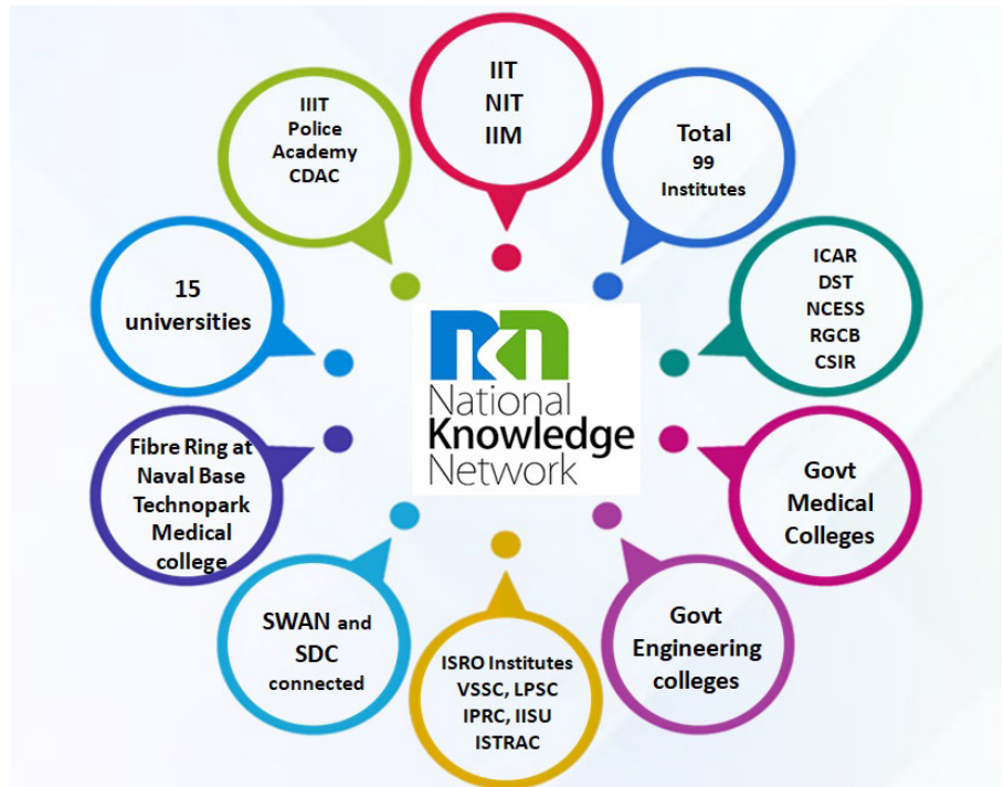
▲ Fig 3.7 : NKN Connectivity