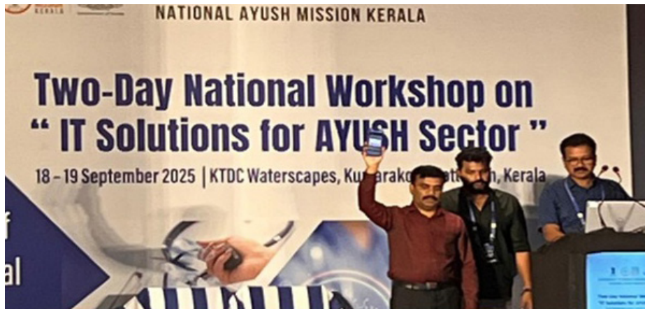
▲ Fig 3.6 : Two-Day National workshop on IT solutions for Ayush Sector