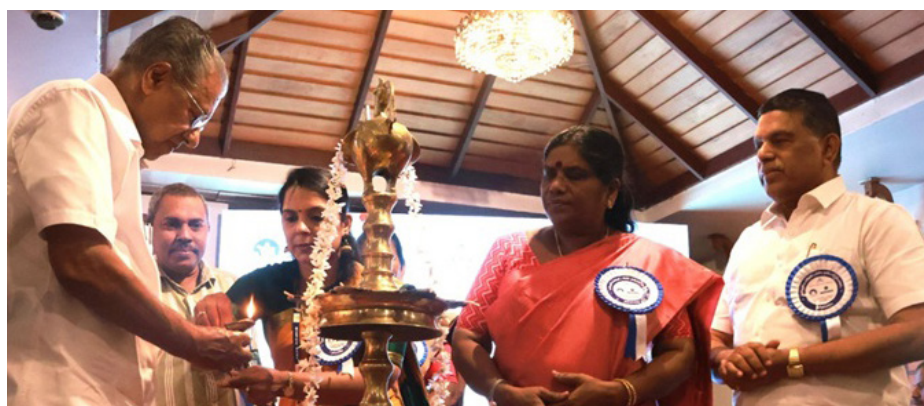
▼ Fig 3.3 : Inauguration of Ksheerashree Portal developed by NIC Kerala

iExaMS is an open-source web-based application for managing Higher Secondary, Vocational