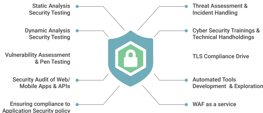
▼ Fig 2.5 Services offered by CoEAS-AppSec Bhubaneswar

NIC Odisha drives impactful collaborations with academia, industries, and private sectors, focusing on cutting-edge research, sustainability models, infrastructure scaling, crowdsourced solutions, and capacity building. Key initiatives include Blockchain integration for secured land records and certificate verification and various AI driven applications like pest surveillance for agriculture, multi-lingual chatbots for Transport and eDistrict, face analytic services for ePrisons, text summarization, report interpretation and intelligence building in Cyber Security, etc. These efforts aim to enhance data security, foster innovation and improve efficiency.