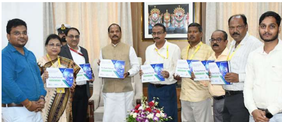
▼ Fig 2.3 : Hon'ble Governor, Odisha Shri Raghubar Das released the Annual Book 2023-24 of National Informatics Centre (NIC), Odisha named as "Digital Pathway – Enabling eGovernance Platforms."

NSAP covers the persons who are below the poverty line (BPL) category. Persons who don't come under BPL status can also get benefits under NSAP provided they should be certified by the Sub Collector based on their income and other criteria.