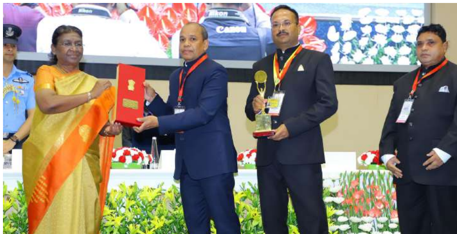
▲ Fig 2.4 : NIC Odisha honored with Bhoomi Samman Award 2023 by Hon'ble President Smt. Droupadi Murmu for excellence in implementing Digital India Land Records Modernization Programme (DILRMP)

Baliyatra, celebrating Odisha’s ancient maritime links with Southeast Asia, was held at Silk City Cuttack from November 27 to December 4, 2023, drawing nearly 5 lakh daily visitors. NIC Odisha, in partnership with the District