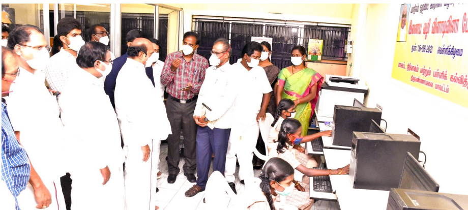
▼ Fig 7.2 : Shri E.V.Velu, Hon'ble Minister visited NIC Centre during Online examination for school students

District Informatics Officer NIC Tiruvannamalai District Centre NIC, Collectorate, Tiruvannamalai, Tamil Nadu – 606604 Email: dio-tvn@nic.in, Phone: 04175-232205