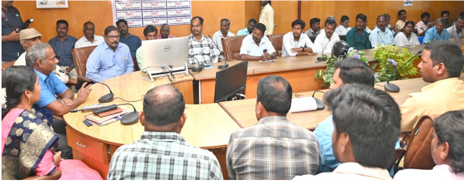
▲ Fig 7.1 : Shri D. Baskara Pandian, IAS, District Collector, Tiruvannamalai addressing the district officials during training of integration of FMB with TamilNilam.

ban, and WebCollabLand projects across all Taluks aims to modernize and digitize land records management, ensuring accurate and accessible land data for residents and administrators.