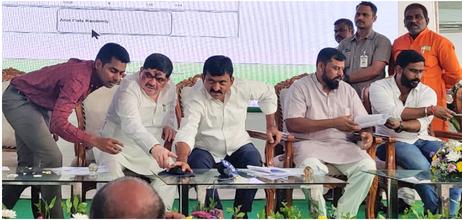
▲ Fig 4.1 : Hon'ble Minister for Housing clicking the button for random allocation of flats