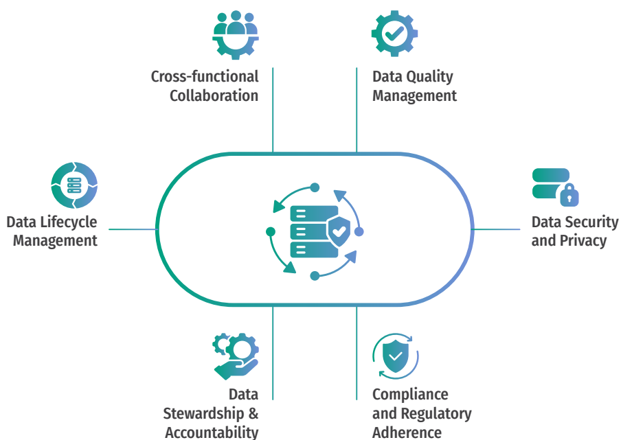
▼ Fig 13.2 Key Components of Data Governance

By implementing these strategies, organizations can ensure sustained compliance, security, and optimal utilization of data assets in an increasingly digital world.