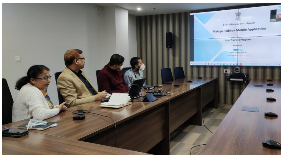
▲ Fig 8.2: Online Training-cum-awareness Programme on MATSYA BAIBHAV conducted for all District and State level officials of Fishery Department