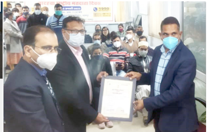
▲ Fig 5.2 : State award for Best Electoral Practices to DIO Udaipur by District Collector on the occasion of 12th edition of National Voters Day

failed transformers, ensuring prompt resolution and efficient management of complaints received through both toll-free numbers and web portals, including those submitted at AEN offices.