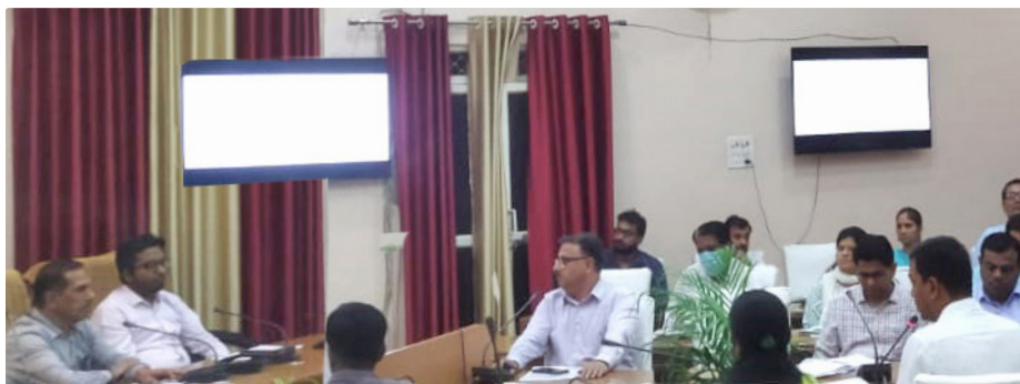
▼ Fig 5.3 : eGovernance Project review meeting chaired by District Collector with other high-level District Officers

The app offers public convenience by allowing easy calculation of lease amounts for plots or flats, considering factors like area, reserve price, and possession date.