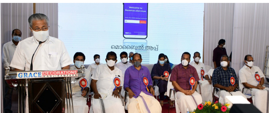
▼ Fig 4.2 : Inauguration of Revenue eServices & Mobile App in order to facilitate the users with easy access of the revenue services

The NIC, Palakkad has played a vital role in organizing e-Governance activities within the district. The web and mobile applications like ReLIS, Revenue e-payment and Revenue e-services etc developed and implemented in the district, are now being used all over the State. Many other initiatives like Care for Palakkad, an online platform for helping affected people of deluge, Aadhaar Enabled Attendance System (AEBAS) for State Government employees which was a pilot programme in the district etc are also being used all over Kerala now. The role of District NIC team in the development and maintenance of District Website, Resurvey Management System, support to General Elections to Lok Sabha, Assembly and Local Bodies are worth mentioning. The dedication and pro-active approach of the NIC team have been instrumental in navigating through the COVID times and other disasters faced in the district. In addition to all the works in district, they have also been giving support for the usage of web applications across the state.