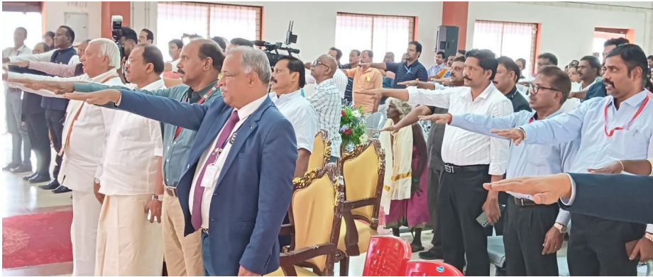
▲ Fig 4.1 : Live streaming of Viksit Bharat Sankalp Yatra's inauguration held on 15th November 2023 at Attappadi Block, Palakkad

pository for Kerala) is an integrated system providing personnel, payroll, and accounts services to all state government employees, including payroll and income tax details. This project has been successfully implemented in the district.