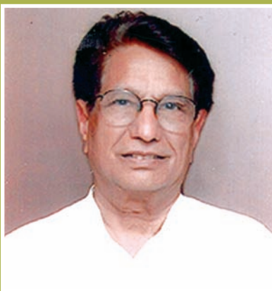
SHRI AJIT SINGH Minister of Civil Aviation Government of India

The most important step for effective launching of the UDAAN application was migration of the data from old database to the new one. The old data consisted of the personal details of the candidates along with their history of