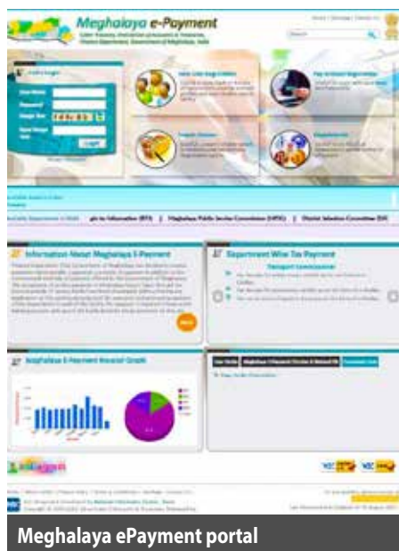
Meghalaya ePayment portal

The “New Pension Scheme” (MegNPS) application is seamlessly integrated with the existing “State Employee Database Project” (MegHEIS) for fetching employee’s information such as subscriber’s profile and contributions details. The information retrieved is