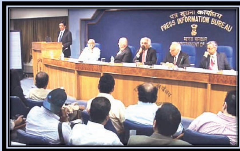
Press Briefing on OGPL – PIB Conference Hall, 30th March 2012