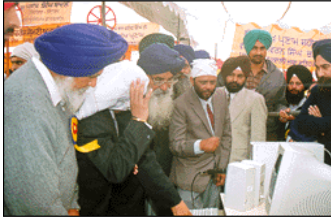
The web site of Distt Fatehgarh Sahib being inaugurated by Sh. Prakash Singh Badal, Cheif Minister, Punjab

computerized M.I.S. These include MIS for Village level Development Indicators, Grants Monitoring System, Micro Planning for terrorist/ riots Focal Point Schemes, Link road Repair Monitoring System, Database of Beneficiaries of Social Security Schemes, Database of terrorist/ riots effected persons, Arms Licensees, MIS for Revenue Recoveries, MIS for Total Literacy Campaign, MIS for Cooperative Societies, PLAN-MIS, Twenty point Monitoring system, Small Savings Schemes Monitoring, Computerization of District industries Centre, DRDA Computerization, Reference monitoring System and Payroll & GPF Information System. Also , the Computerization of DRDA under Client Server environment is in progress and Computer Centre for Rural Youths under TRYSEM is already running in Distt. Fatehgarh Sahib. Beside the above, NIC Unit was also actively involved in the implementation of Information system for conducting National wide special Health checkup programs for schools in July 1997, conducting Lok Sabha polls in Feb.,1998 and Panchayat Samiti polls in May 1998.