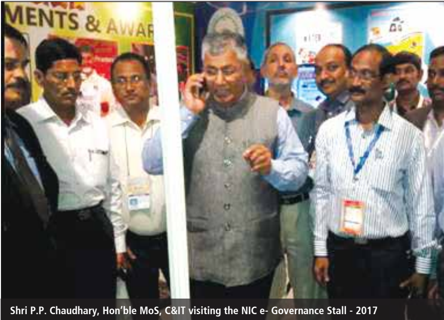
Shri P.P. Chaudhary, Hon'ble MoS, C&IT visiting the NIC e- Governance Stall - 2017

grass root level. Almost all the departments in the District have onboarded to AEBAS.