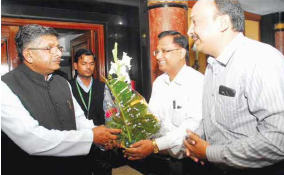
DIO & ADIO welcoming the Hon'ble Minister E&IT and Law & Justice, Shri Ravi Shankar Prasad on his visit to Visakhapatnam