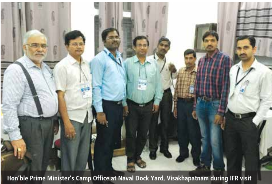
Hon'ble Prime Minister's Camp Office at Naval Dock Yard, Visakhapatnam during IFR visit

CII, PARTNERSHIP SUMMIT has been conducted jointly by the GoAP and CII (Confederation of Indian Industry) for attracting the business community to establish the industry and startup companies in AP. The summit was attended by delegates from various countries. NIC has