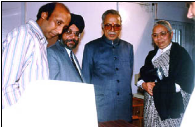
Justice Doraiswamy Raju (centre) at the inauguration of the District Courts Computerization in Himachal Pradesh.

Shimla : The District Courts Computerization in Himachal Pradesh was recently inaugurated at the District Court, Shimla by Sh.Doraiswamy Raju, Hon'ble Chief Justice of Himachal Pradesh High Court. The Daily List of Business (cause list) is now being generated through the computerized system.