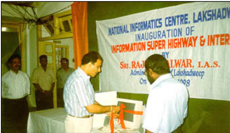
Inauguration of Information Super Highway at Lakshadweep

With the commissioning of this facility, Lakshadweep has been connected to the rest of the world through 'information super highway'. This has been made possible with the installation of the state-of-the-art high speed VSAT (IP-Advantage) at National Informatics Centre, Kavaratti.