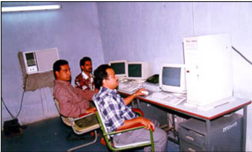
The Staff at work in the NIC-Gajapati District Unit

The NIC District Unit, Gajapati started providing the Informatics support to the District Administration from February'97. The the key objective of the Unit was to generate basic computer awareness and promote Informatics culture in the District where the literacy rate is merely 25%. Apart from this, the other main aims of the Centre were to develop necessary MIS in various sectors and to strengthen the capacity of analysis and quality presentation of statistics utilized for decision making and implementation of National and State level projects.